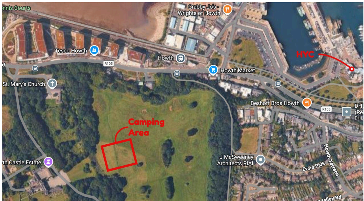
Figure 2: Map to Camping Area

All communications for the event will be via the IODIA WhatsApp groups. If you have not joined please ensure you do prior to the event.