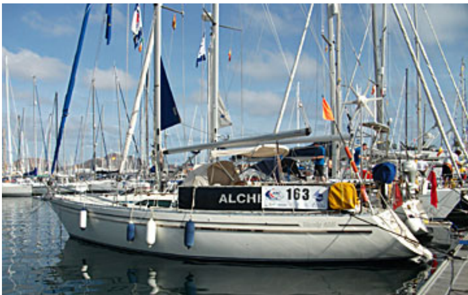
Alchemy - Moody 42.5

Approximately 220 boats assemble in Las Palmas for the start of the event. The last few days before the "off" are frenetic with briefing, seminars, provisioning, safety checks, parades and last minute preparations.