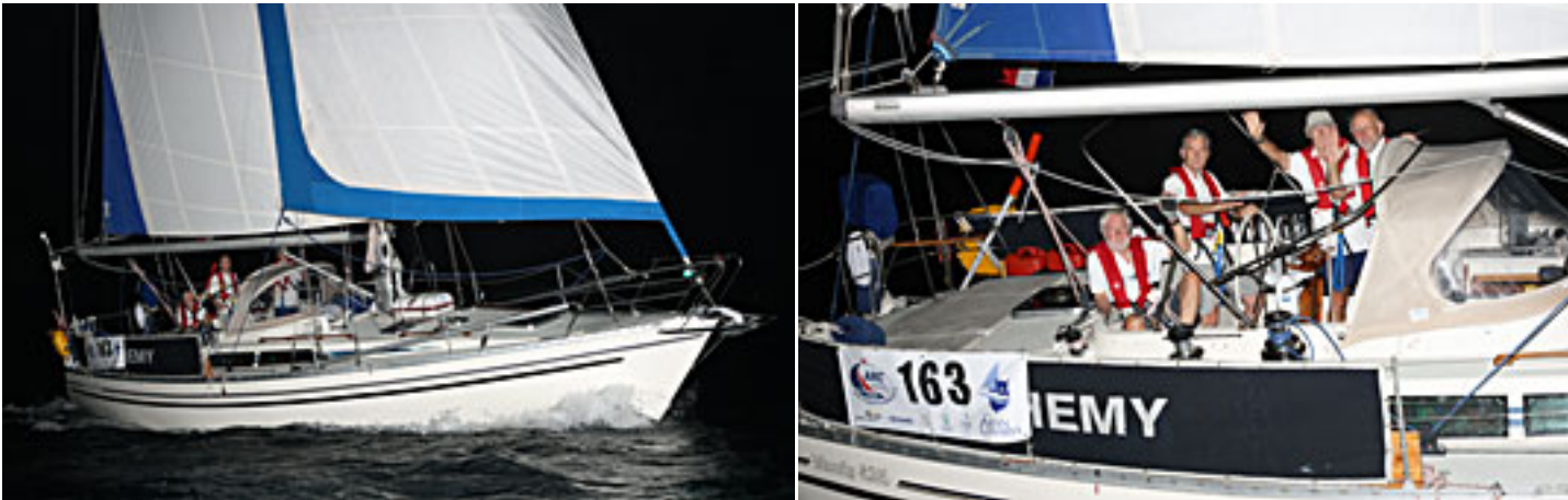
Crossing the finish line

The final approach to St. Lucia was at dusk under a reddening sky. Full darkness fell as we rounded Pigeon Island for the finish. The last mile is on the wind which is strange after 3000 miles of downwind sailing. We could scarcely see the narrow entrance to the marina so we tagged along behind a Rum Runner boat after an evening drinking in the bay.