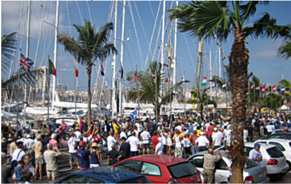
Yachts, sailors & onlookers at Las Palmas in Gran Canaria

The ARC (Atlantic Rally for Cruisers) takes place each year in late November leaving Las Palmas in Gran Canaria and sailing to Rodney Bay in St. Lucia, a distance of just under 3000 miles. The timing of the event coincides with the end of the hurricane season, the establishment of the Azores trade winds and to allow time for the yachts to arrive in the Caribbean.