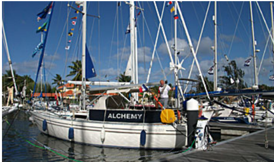
Alchemy alongside in Rodney Bay Marina, St. Lucia

The final approach to St. Lucia was at dusk under a reddening sky. Full darkness fell as we rounded Pigeon Island for the finish. The last mile is on the wind which is strange after 3000 miles of downwind sailing. We could scarcely see the narrow entrance to the marina so we tagged along behind a Rum Runner boat after an evening drinking in the bay.