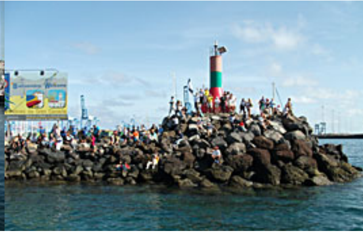
Well wishers wave farewell

Departure day itself was exciting. Brass bands marching up and down the quay, crowds out in their summery best, some guy on a loud speaker calling out the boat's name as each one left the marina, very much like radio commentators shout "GOAL" in Mexico at football matches.