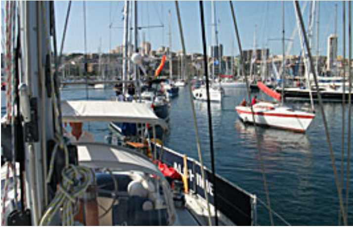
Boats heading out