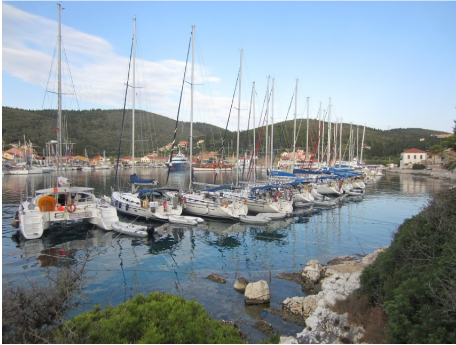
Fiskhardo before the storm