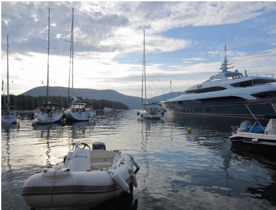
Early morning in Fiskhardo

Day 3: Next was a short hop to Sívota back on the island of Lefkas via the marble beaches and turquoise seas of Ithaka.