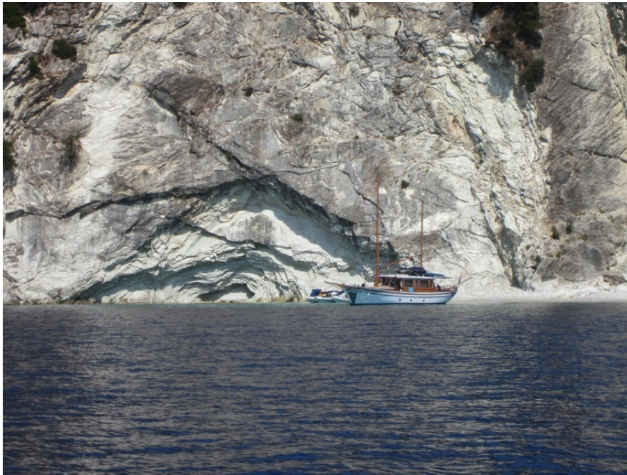
Meganisi – cave-in-waiting

As this was our “free-sailing” day, we were not as constricted by the Flotilla schedule – nightfall was our only deadline for arrival at our destination. We hove to for lunch once reaching the Southern tip of Meganisi. Halfway up the East coast, the afternoon breeze slowly began to ripple the water, and finally gave us a sporting beat almost all the way into Abelike Bay. Cozy and sheltered from the strong breezes, Abelike was idyllic, but also busy. A motor yacht dominated most of the view and illuminated the entire bay. Once again, our kayaks and the dinghy gave us a chance to get away from it all and enjoy the starry Ionian skies.