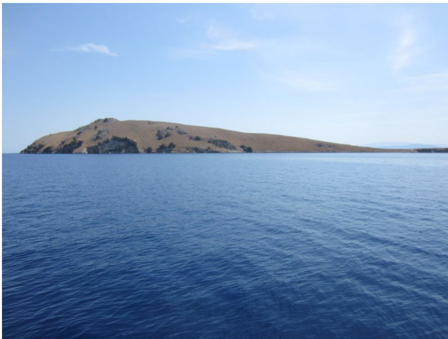
Lunchtime view at Meganisi