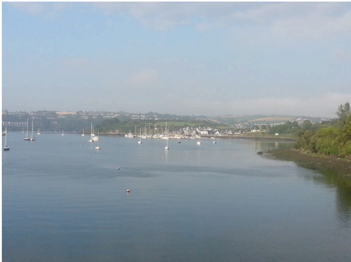
Castle Park Marina, Kinsale