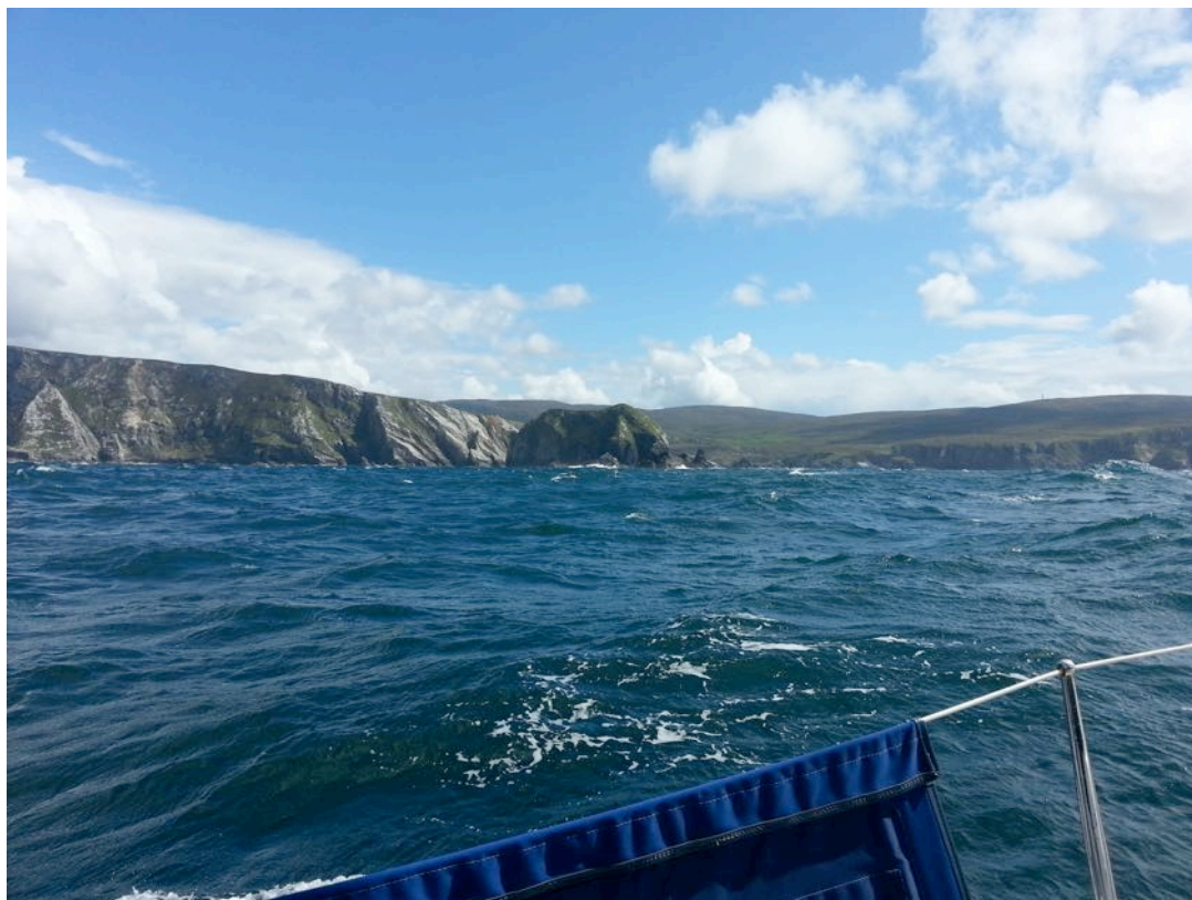
The Hidden entrance to Teelin