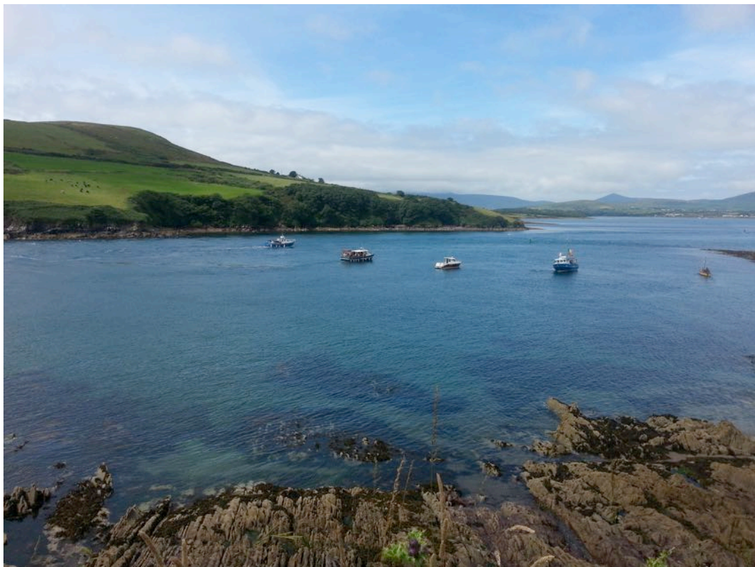
Dolphin boats in the entrance to Dingle