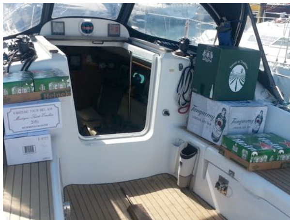
The Bond arrives

Departure Music We are Sailing – H.M. Royal Marine Band