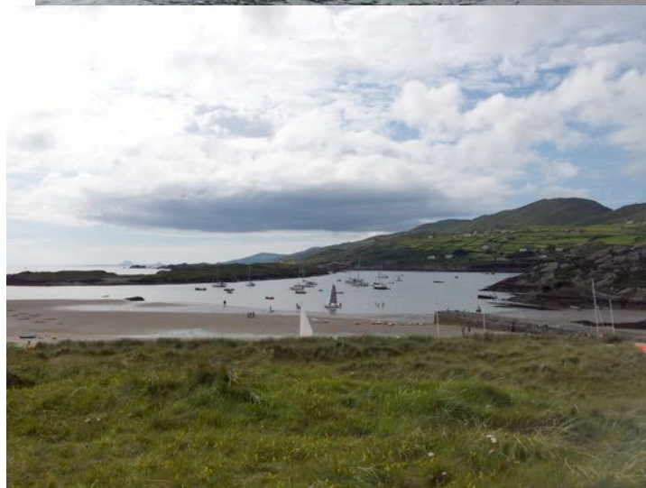
Skellig Michael and Derynane Harbour