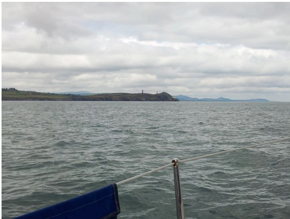
Wicklow Head – Bray Head in the distance

Back on board to find a burnt fender – for some unknown reason the Eberspacher heater had switched to program and turned itself on and the fender was close to the exhaust – Could have been really serious. Deleted all the program timers so should be OK now.