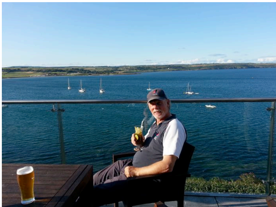
Taurus in the Bay – view from The Cliff Hotel, Ardmore

Dinner on board cobbled together but very good.