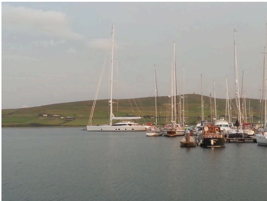
Now that's a big Yacht