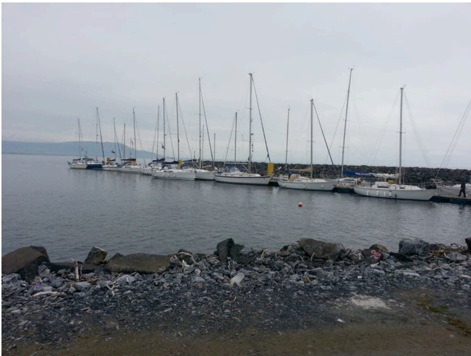
Greencastle Pontoon after the storm

Shopped for essentials and water in the village. Dined out in Kealy's Seafood Bar with all the Association – Paying the Bill got very messy due to the inflexibility of the staff.