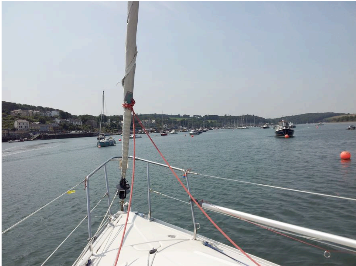
Entrance to Crosshaven and the Royal Cork YC

Another great sunny morning, on the way by 0900. motored out to the Sovereign and then managed to sail with long tacks out into a slight easterly, just two tacks got us to Cork harbour. Engine on and motored up to the Royal Cork YC Marina and all berthed at 1415. Shopped in Crosshaven, lunch at Pub and dinner on Board Sunny all day. Lazer regatta at Royal Cork and we met a few Howth sailors who are doing well in the regatta