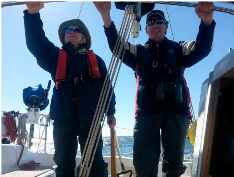
On route to Ardglass

Good dinner of Lambay Fillet Stake from Colliers of Howth