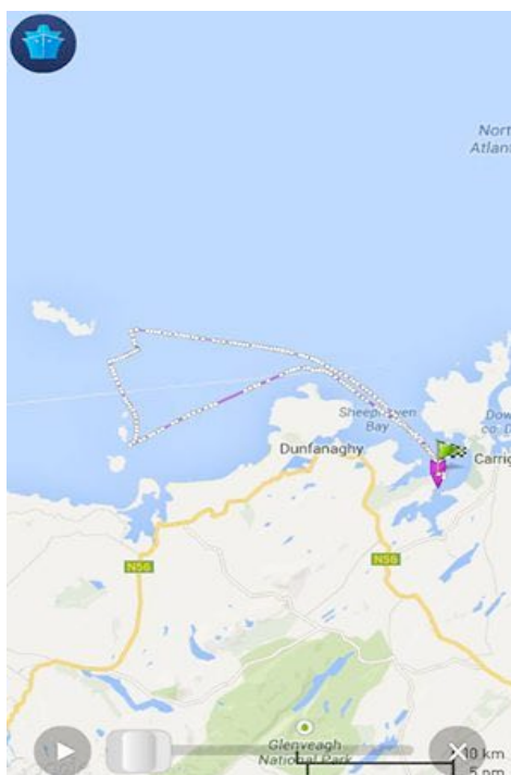
Ards Bay, well sheltered

Found out that a Nautical Mile is Longer, Wetter and more Expensive than a normal mile!