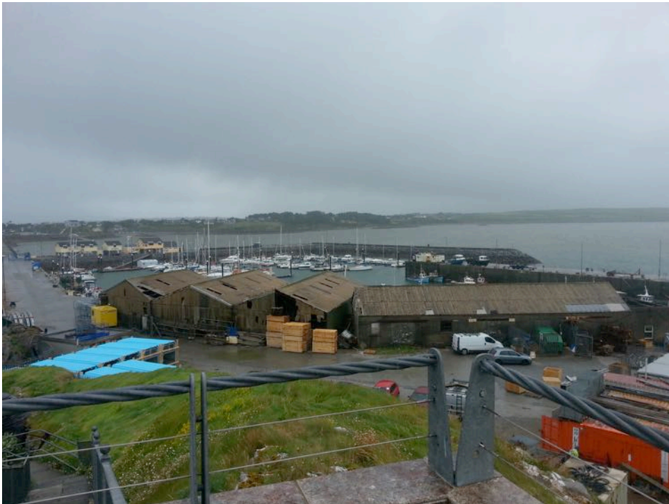
Fennit Marina from Brendan the Navigator

We had ice in the Gin – first for a week