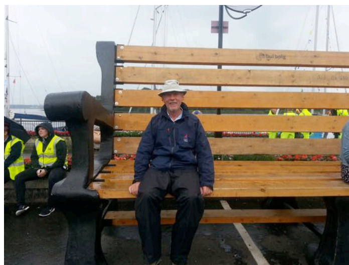
In Derry / Londonderry