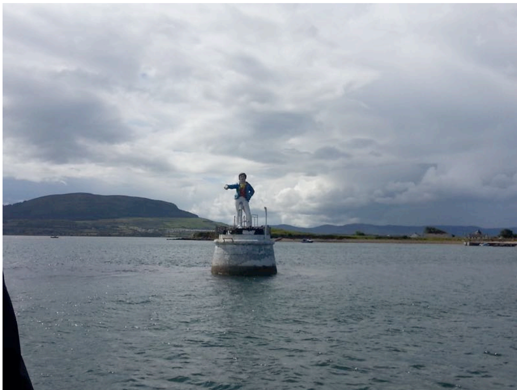
The Metal Man, Sligo