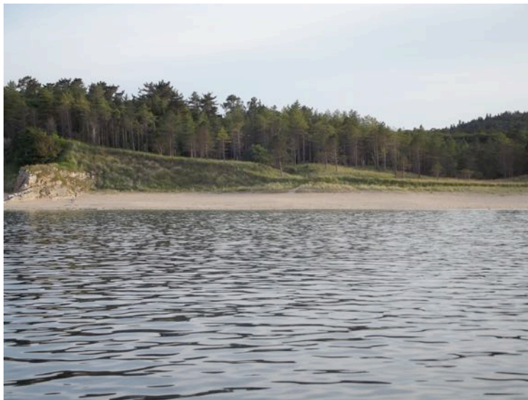
Monks Bay before the storm

Anchored for the night in Sheephaven Bay in a little bay called locally Monks Bay – should be sheltered if the predicted wind starts to blow. Very secluded and pretty bay.