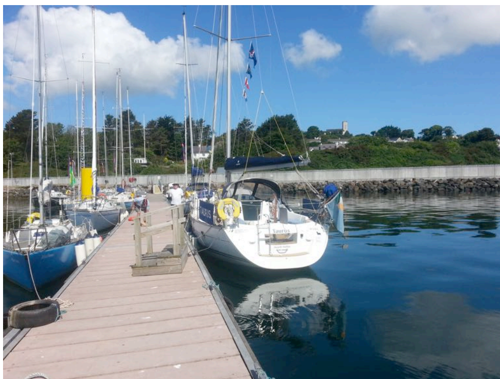
Greencastle Pontoon again but on a nice day

Dinner ashore before we departed down the river with the tide at 2100. Dark at 2300, motored quietly along the river and the Lough - navigating by lights. Some lights are very difficult to see or seem to disappear at odd moments – found out this is due to roosting cormorants!. No wind at all so Greencastle was very sheltered, a complete contrast to our last visit. All settled by 0030 for a quiet night.