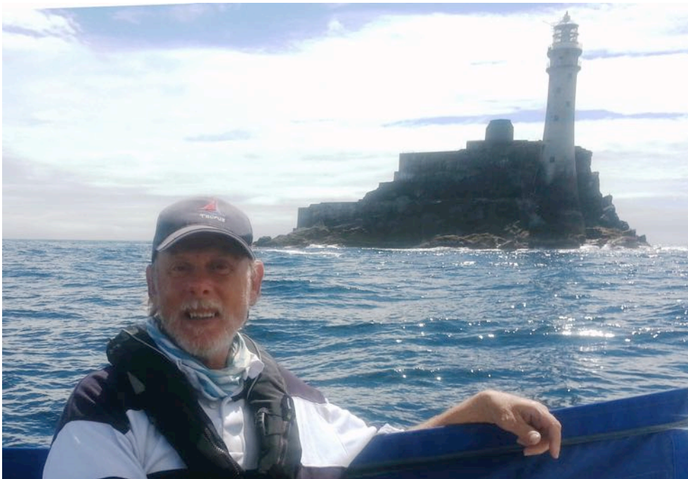
The Fastnet Rock

Baltimore is a pretty place did some shopping and found Bushe's pub in the sun, the Lifeboat pagers went off and all the staff ran off to join the Lifeboat. After about 10 minutes a young 14year old girl ran up to the pub, slotted behind the bar a asked "whose next?" – normal service resumed.