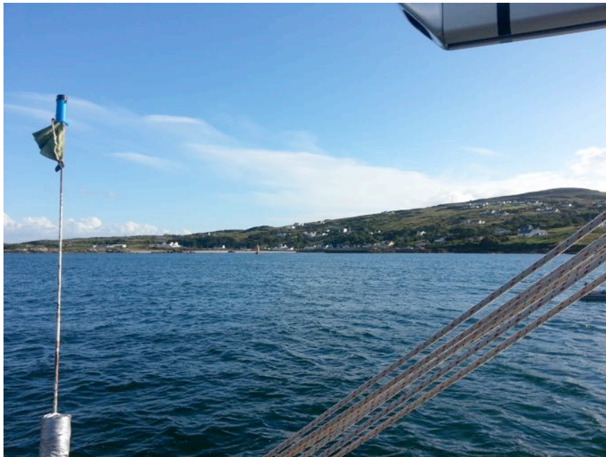
Entrance to Arranmore Harbour

At 1900 we picked up a visitors mooring in Arranmor – a bit of a roll but all tired and unaffected by the movement.