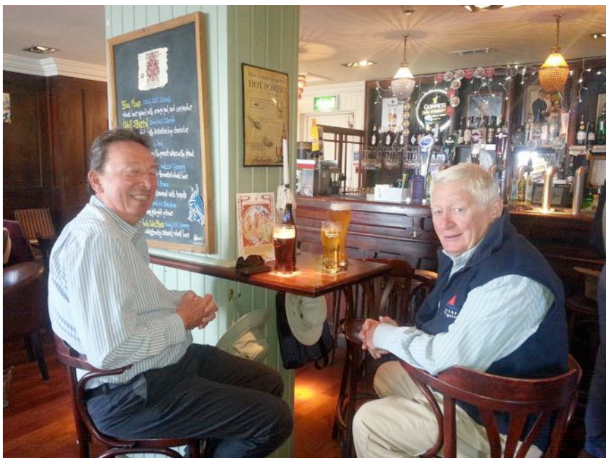
Jamaica Inn and its not in Cornwall!

Dinner on board was just soup but it was lobster bisque and garlic bread.