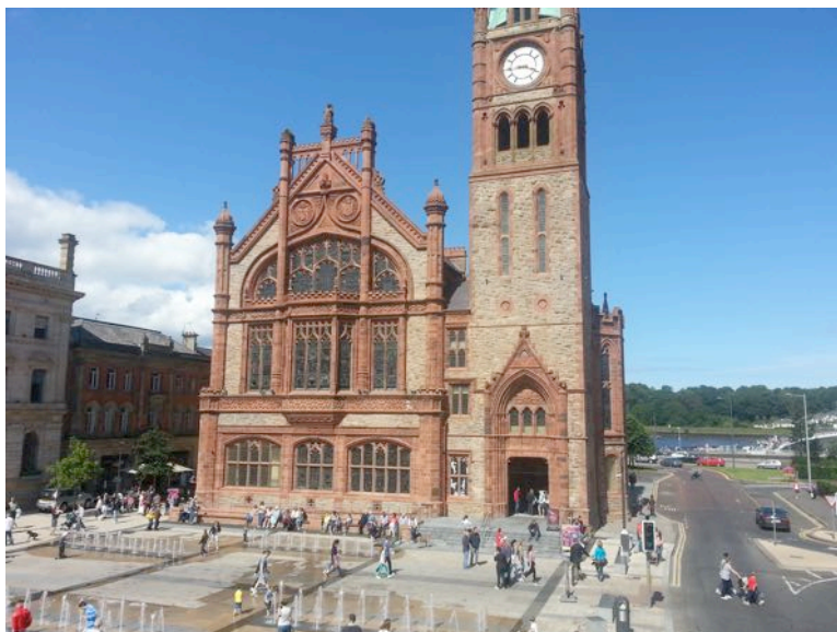
The Derry Walls and the Town Hall