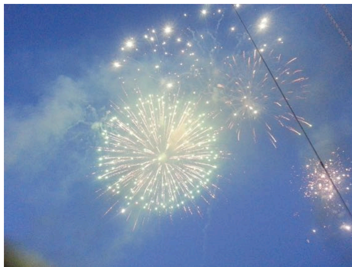
The City Council claimed responsibility