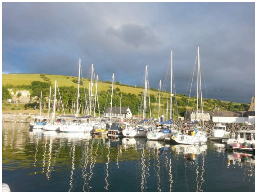
Glenarm Marina in the Evening

Dinner on board and then joined up with the other cruisers in the village pub for the evening.