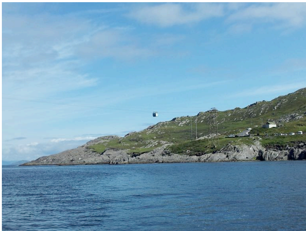
Dursey Island Cable Car over Dursey Sound

Got the chute up again on the other side and used it as a spinnaker until the wind died in Bantry bay. Passed into Castletown Berehaven and up the sound to Lawrence Cove on Bere Island. This is a lovely small marina in a very sheltered spot with a shop and a pub. A lot of Bere Islanders moved to Howth and keep holiday homes on the island.