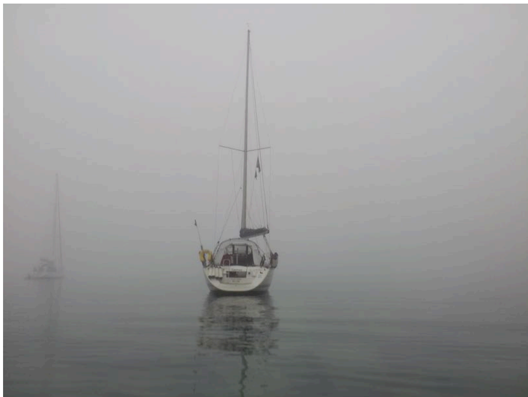
Taurus in the mist at Crookhaven

Looks a great safe bay for children and water sports – if only we could see it.