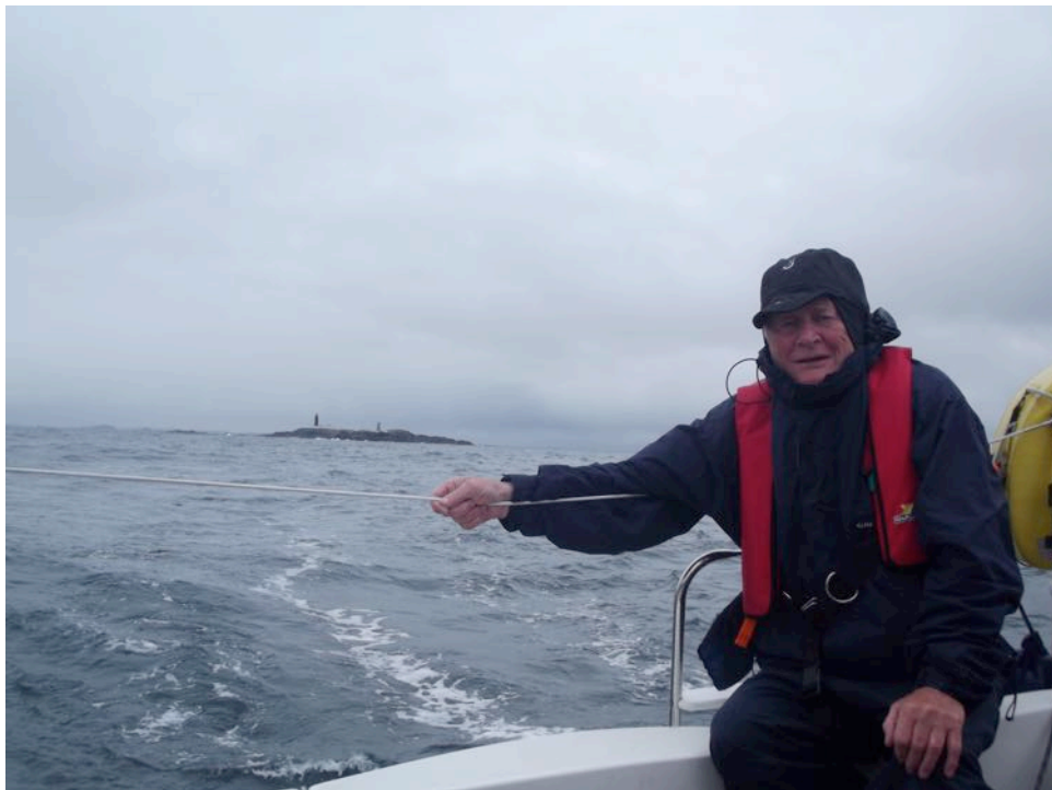
Slyne Head during a clear spell