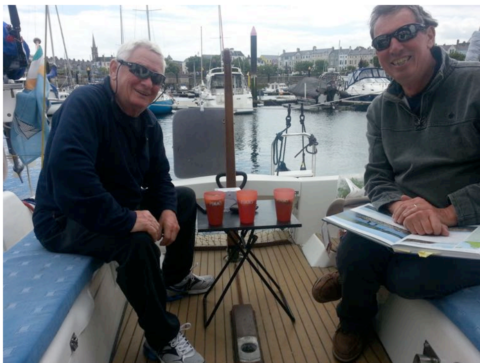
Pimm's O'Clock in Bangor Marina

Joined in the Marina by Hannah G II, Astrid, Rhiannon, Tobago, Asile and Arctic Fox. (Tobago also planning to continue around Ireland.) 14 of us went for dinner at a very good recommended Indian restaurant in the City “Bukhara” Night cap on board for those that do! – Skipper is currently on a dry run and has been for a year.