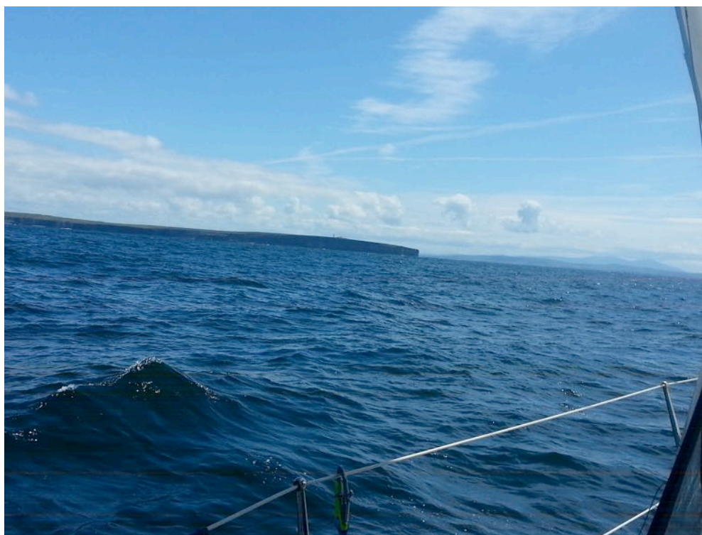
Loop Head at the entrance to the Shannon

The inshore lifeboat lives out of the water but in a floating boat house. Rosheen Bawn and the Malahide Yacht still with us.