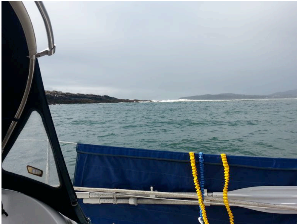
Monks Bay as the swell creeps in

Wind increased and the waves started to dump on the sandy beach preventing a dinghy landing so confined to boat all day – will see what tomorrow brings.