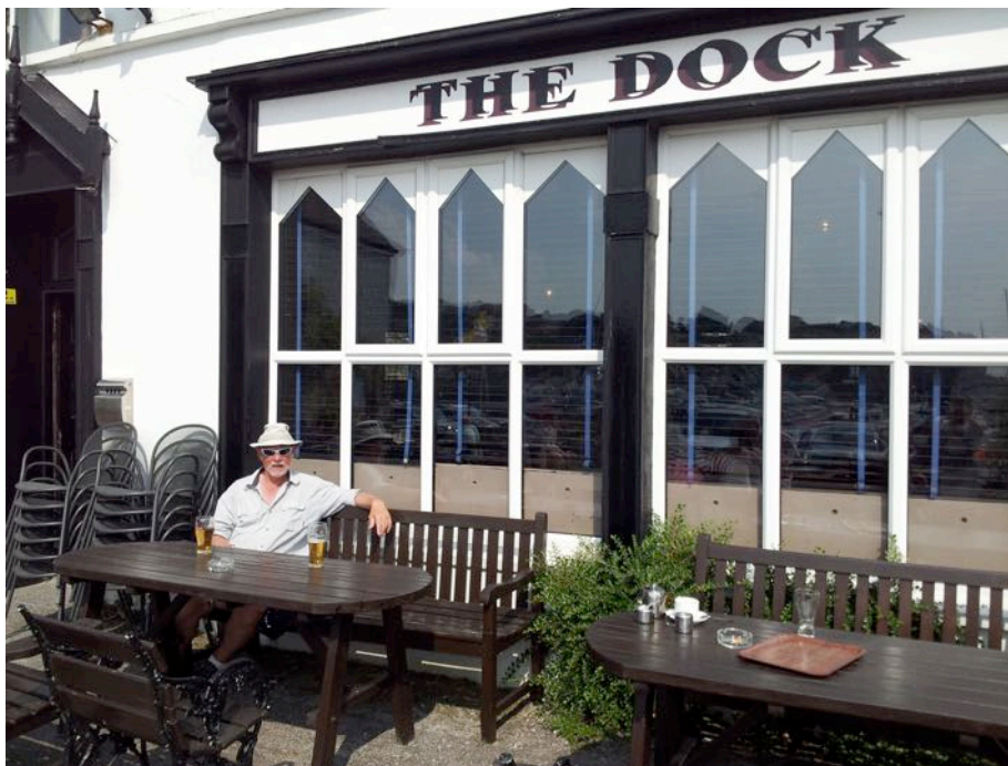
Castle Park Marina Facilities

Did laundry at Castle Park – Marina same cost as Kinsale if you don't mind the attractive walk into town Rosheen Bawn picked up a mooring off the point.