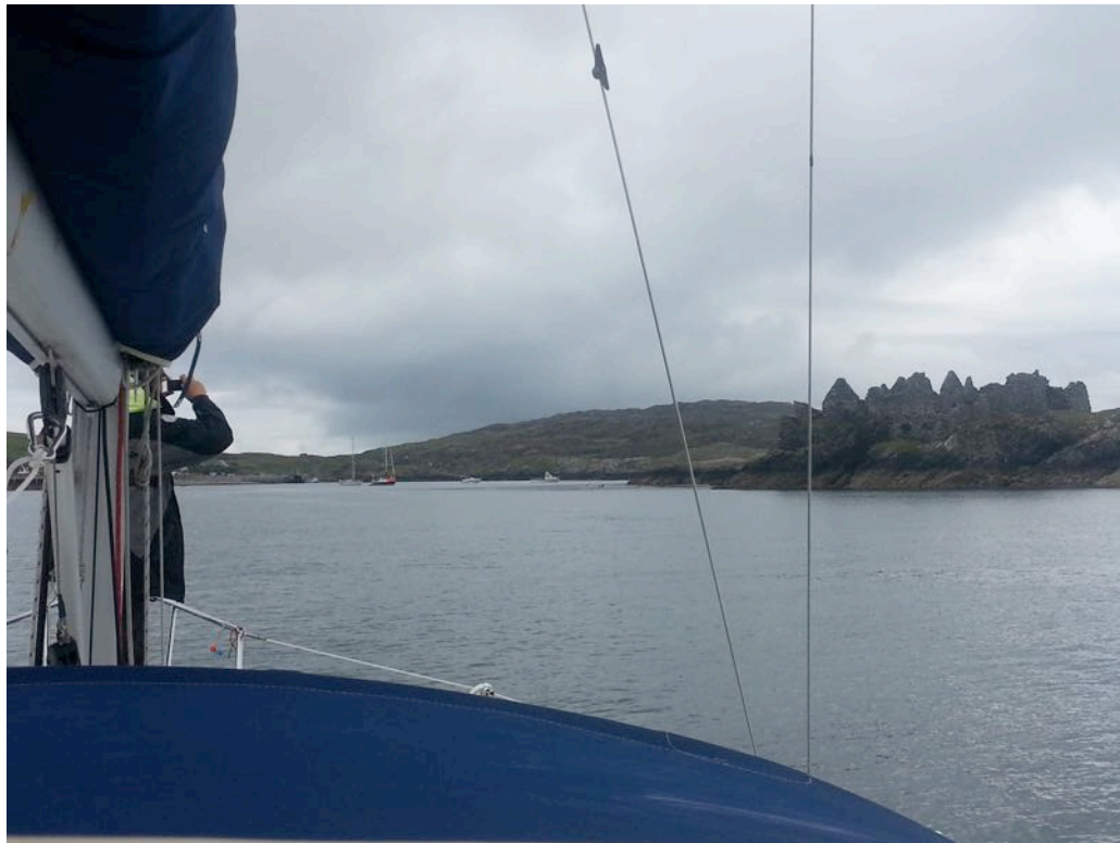
Cromwells Castle / Barracks, Inishbofin entrance

Drizzle and mist as we left the harbour to motor through the shallows and islands to reach Inishbofin. A testing entrance leads into a wonderful sheltered harbour, picked up a mooring at 1230 – ashore for lunch in the Island Hotel – this is a modern Spa Hotel specializing in weddings – not an island feel at all. Saw our first yachts since Tory Sound.