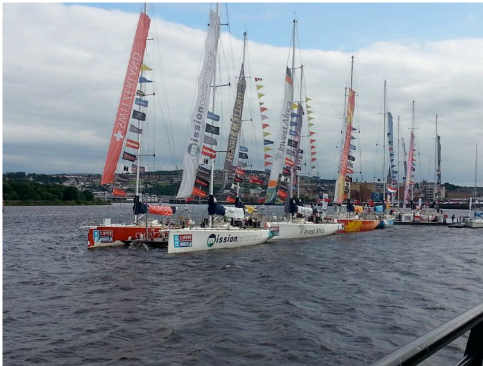
Big Boats in Derry