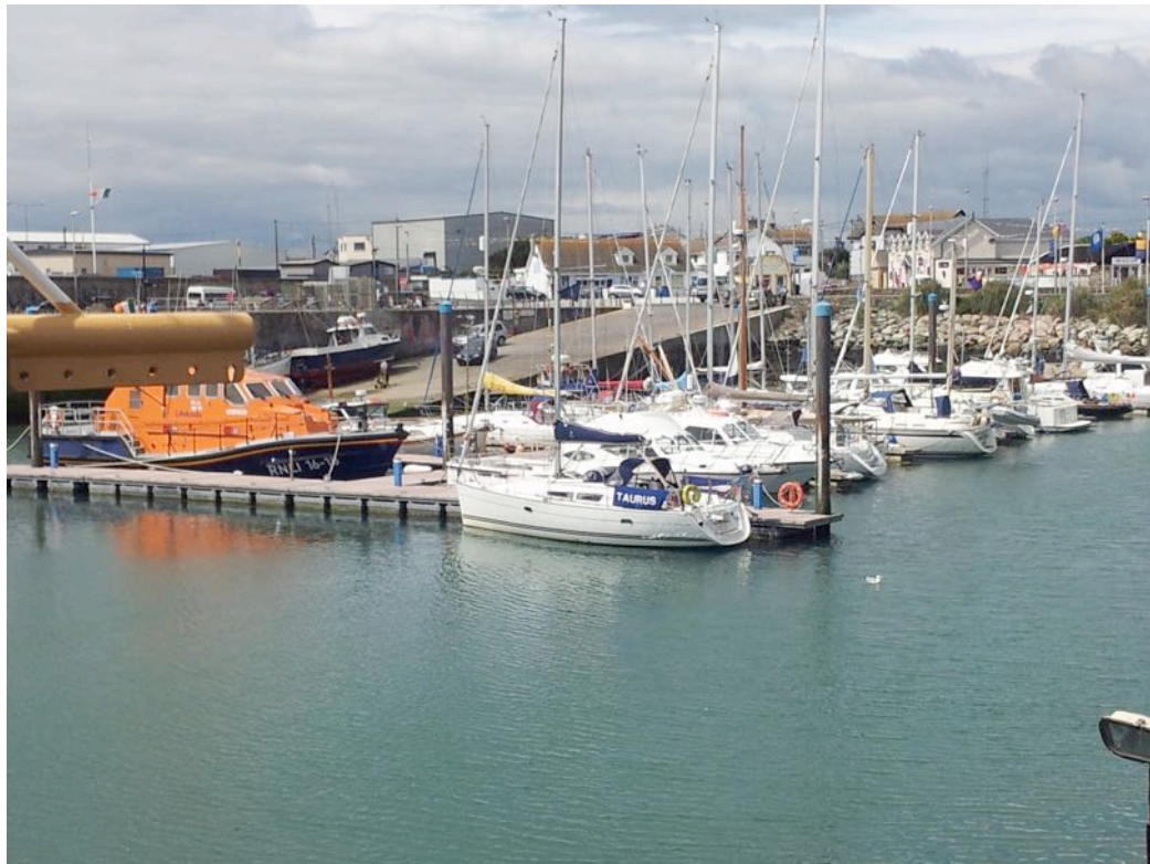
Kilmore Quay Marina

The plan is to be on our way by 0500 so an early night.