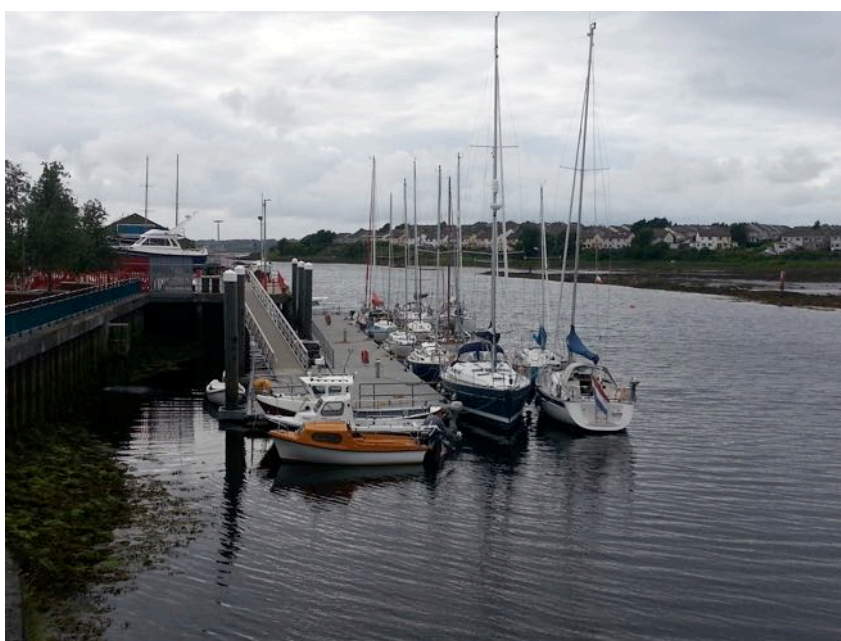
Sligo Town Pontoon

A boat from the Isle of White rafted up to us having crept though the mud against the tide – they are on the way to the Hebrides and using Sligo for crew changes.