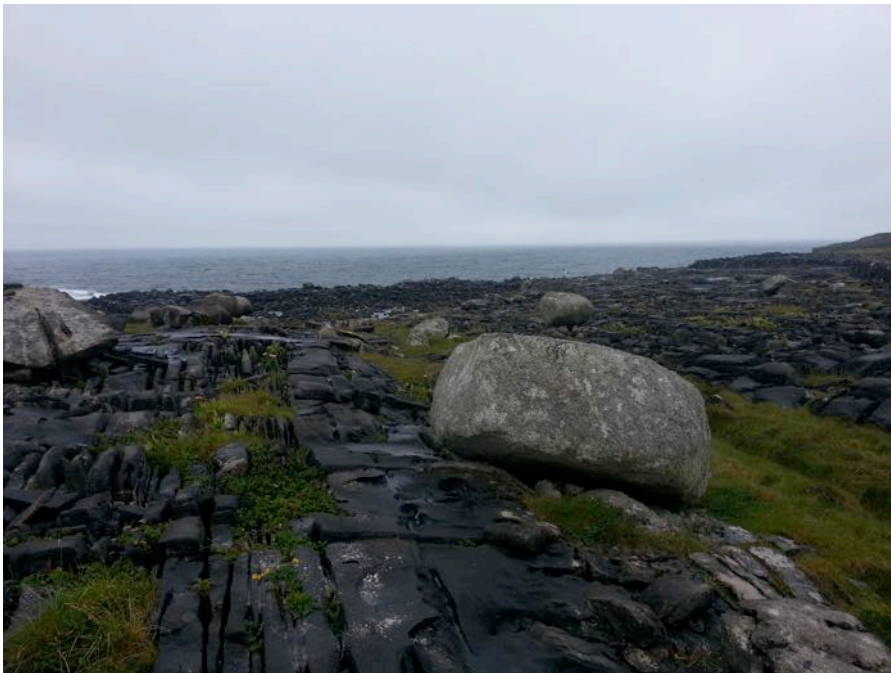
Non native boulders thrown up by a storm

It was wet for most of the day but the evening fine – made a plan for Fenit tomorrow