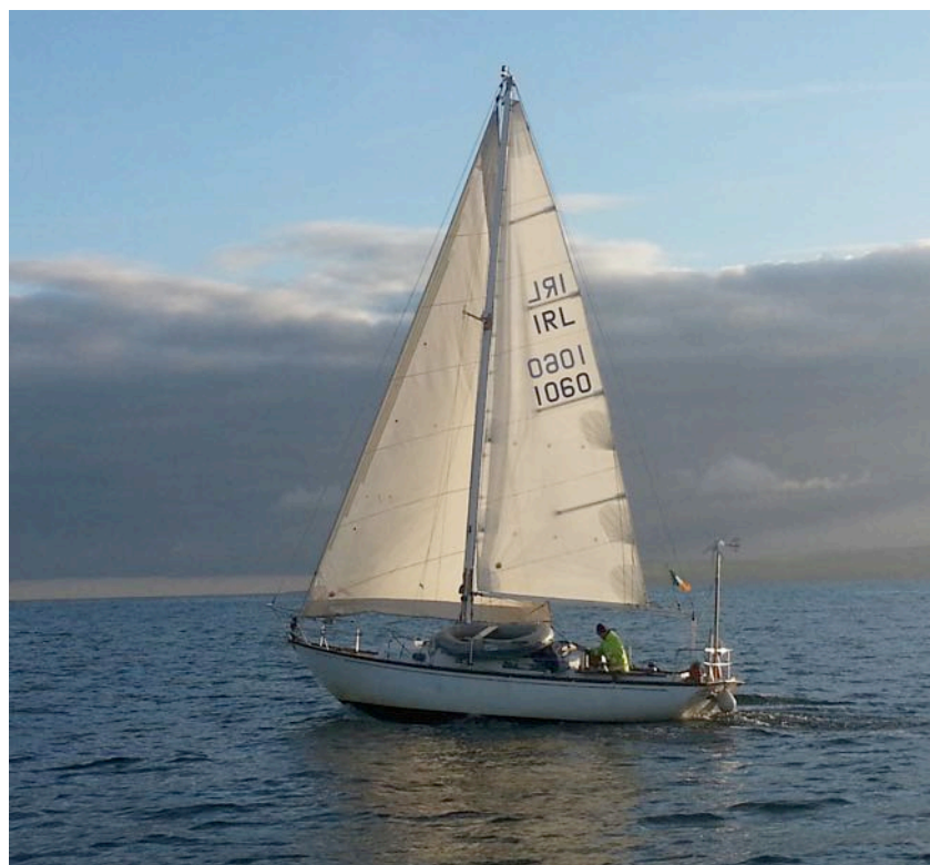
Rosheen Bawn in the Magharee Sound – early

Left at 0530 together with Rosheen Bawn and Emma Grace (Malahide yacht) on a very clear and sunny morning – motored with the main up. Though the Magharee Sound at 0715 – straight forward at slack water. Great scenery as we passed along this spectacular coast, past lots of headlands and the Seven Sisters till we entered the Blasket sound at 0930. Sailed into Great Blasket Bay to see the ruins of the deserted village. Left the sound at 1030 and were flying along towards Dingle. Dingle entrance is very secluded and hidden from view until you are almost past it. It has a very narrow entrance and is crowded with tourist boats all hounding Fungi the Dolphin who surfaced alongside Taurus, this causes all the tourist boats to race straight at us with no regard for buoyage or Rules of the Road. This causes a bit of difficulty for a first time yacht trying to avoid the rocks in the entrance and find the first navigation mark! Tied up in a very nice marina in the pretty town of Dingle at 1330 – all built on the back of the popular Fungi.