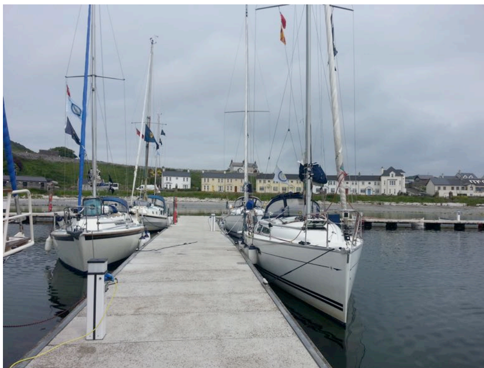
The Pontoon at Church Bay, Rathlin

A nice walk around the Harbour environment, saw the island cars! Visited the pub and ordered fresh lobster to be cooked for us from the little fish shop After an excellent Lobster and fish dinner joined the rest of the party in the pub.