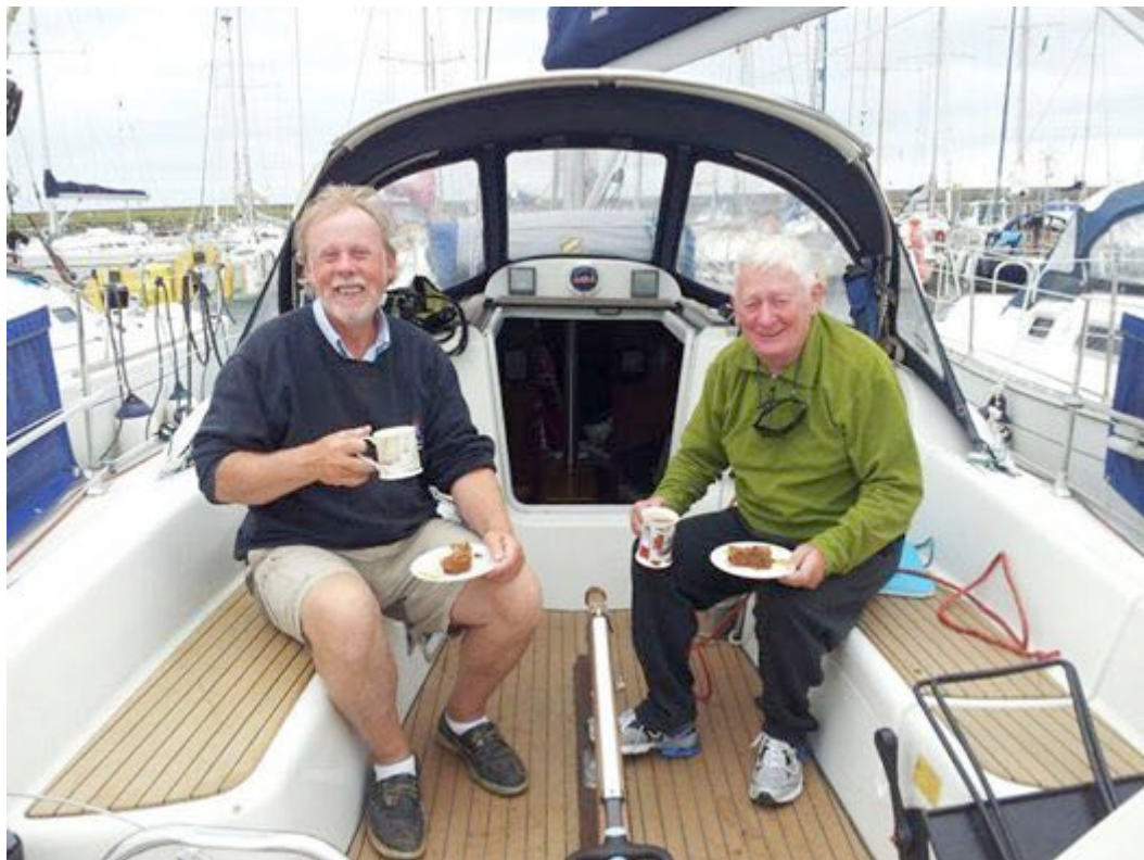
Home from the Sea